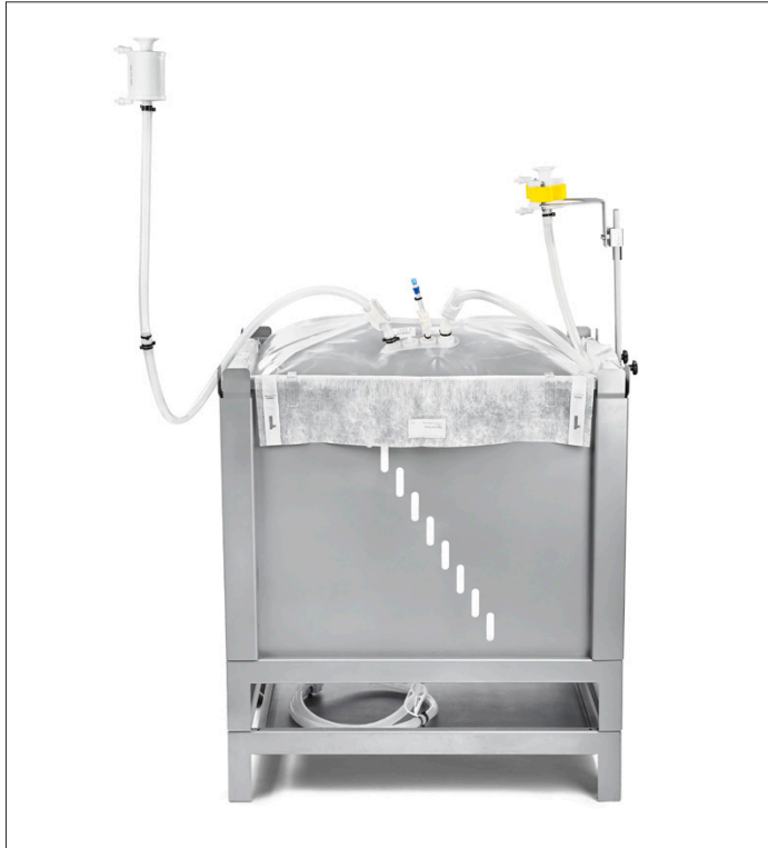
Figure 2: Example of a Flexsafe® 3D Bag fitted with the PoU-LT line

PoU-LT is applicable to Flexsafe® Storage and Shipping Bags from 50 L up-to 500 L volumes