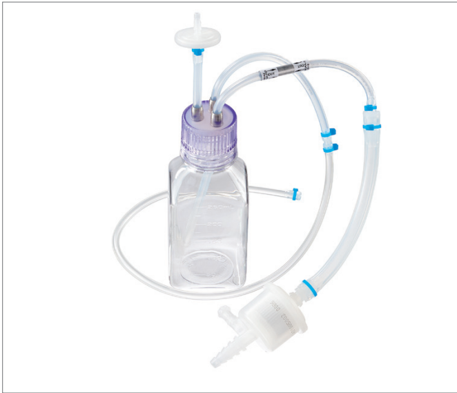
Before Media Fill