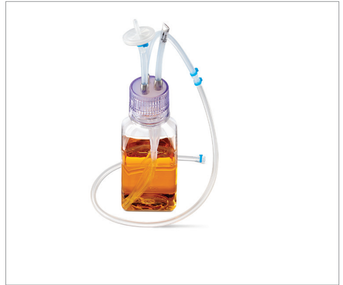
After Media Fill