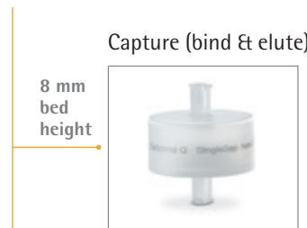
nano 3 mL