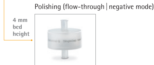
nano 1 mL