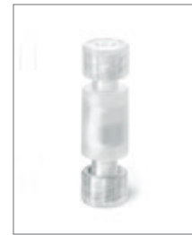
pico 0.08 mL