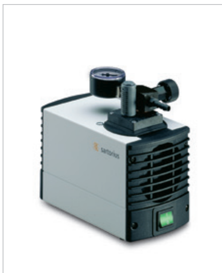
Microsart® mini.vac Laboratory Vacuum pump 6 l/min for 1-branch manifolds and individual filter holders