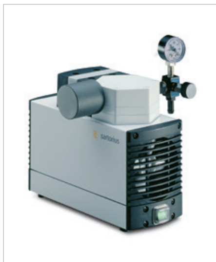
Microsart® maxi.vac Laboratory Vacuum pump 22 l/min for 3- and 6-place manifolds

Laboratory Vacuum Pumps for Microbiology Analysis