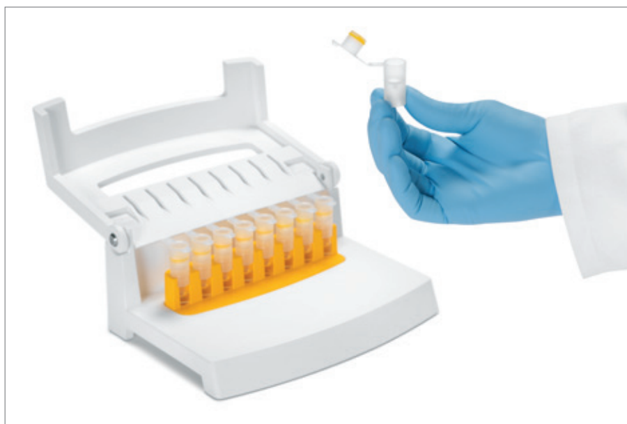
Figure 1: Claristep® filter and Claristep® base

The following demonstrates the applicability of the Claristep® system through clarification of fourteen food samples that are difficult to filter. The comfort of users is also compared with conventional syringe filtration methods.