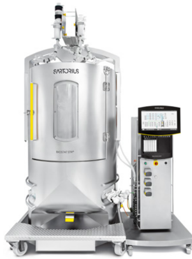
Biostat STR® 1000