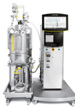
Biostat STR® 50