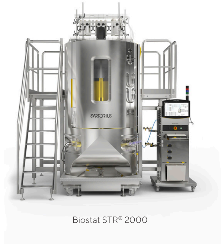
Biostat STR® 2000