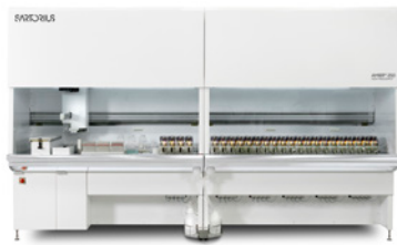
Ambr® 250 High Throughput