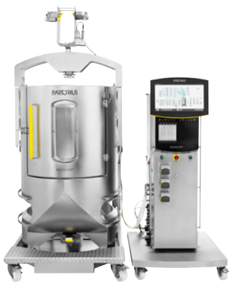
Biostat STR® 500

← Also scalable to multi-use technologies →