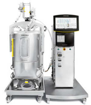
Biostat STR® 200