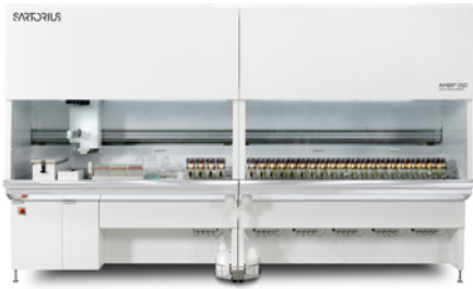
Ambr® 250 High Throughput