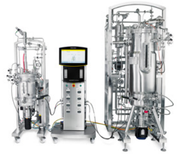
Biostat® D-DCU 10 - 200 L

← Also scalable to multi-use technologies →