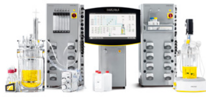
Biostat® B Univessel® SU 2L