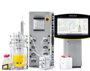
Biostat® B-DCU with Univessel® Glass 1 - 10 L