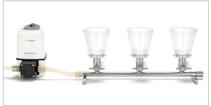
Microsart® Manifold with Biosart 250 Funnels and Microsart® e-jet Pump (Pump and Funnels are not included in the delivery content)