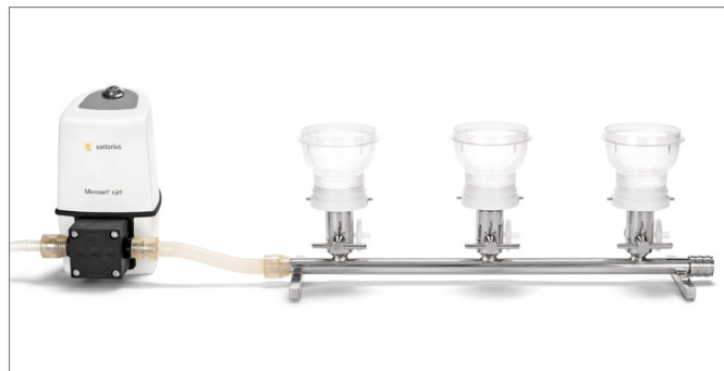
Microsart® Manifold with Microsart® @filter units and Microsart® e.jet Pump (Pump and Filtration units are not included in the delivery content)