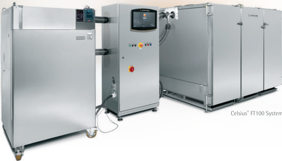
Celsius ® FT100 System